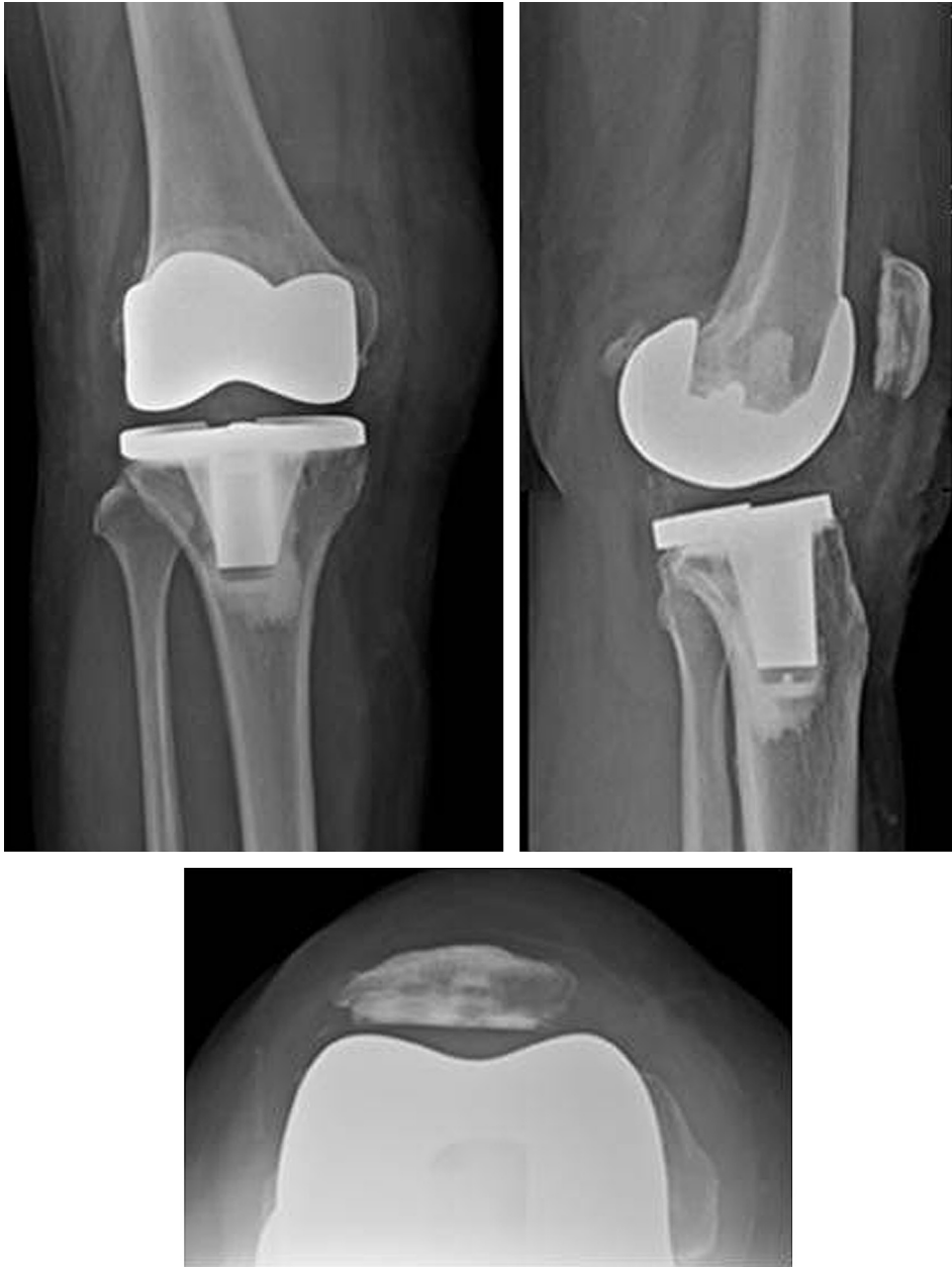
Fig. 3. Radiographs after total knee arthroplasty and patellar component revision.