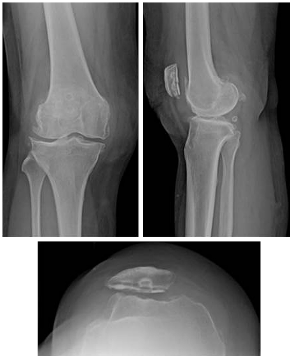
Fig. 2. Resurfaced patella and severe femoral contact area wear.

For cases of PF arthroplasty only, further surgery would be required if the PF component fails or femorotibial arthritis develops. However, in selected patients with PF problems only, it appears that a satisfactory outcome could be achieved by a well-performed PF arthroplasty. 2 In this case, severe patellar polyethylene wear and cartilage erosion were seen. This proved that polyethylene did not articulate well with the femoral articular part in this hemiarthroplasty procedure. We supposed that the original surgeon might come up with this idea from the hemiarthroplasty of the hip. But in treating PF arthritis, isolated patellar surfacing will not succeed if the opposite femoral arthritis exists. The inadequate tracking and the deformed knee axis due to degeneration would accelerate the polyethylene wear and cartilage erosion. Also, the poorly articulated PF joint makes the wear and erosion more rapid because the reaction force is not well distributed. 10 In the hemiarthroplasty procedure, what the clinician can do is to only adjust the location of polyethylene on a