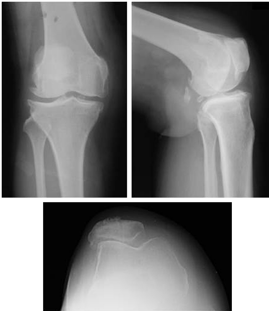
Fig. 1. Right knee patellofemoral component osteoarthritis with patella lateral deviation and femorotibial osteoarthritis.

Femorotibial osteoarthritis was also seen (Fig. 2). The patient then underwent total knee arthroplasty with patellar component revision in our institute (Fig. 3). Severe wear of the femoral cartilage and patellar polyethylene surface were seen during the operation. Severe synovitis was also seen (Fig. 4). No infection was identified from the microorganism culture taken intraoperatively. After the surgery, the range of motion of 0–140° and improved pain were noted during follow-up.